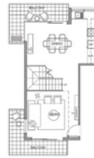
End Unit w/ Balcony