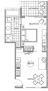
Mid Unit w/ Balcony