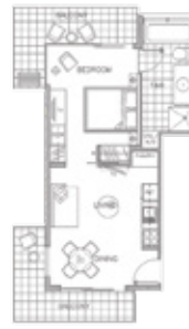
End Unit w/ Balcony